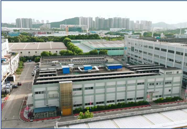
The factory occupies a large area.