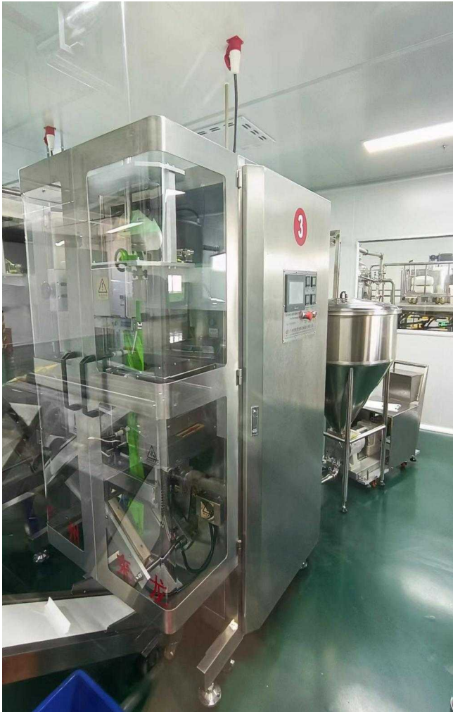
Stringent Food Safety Safeguards