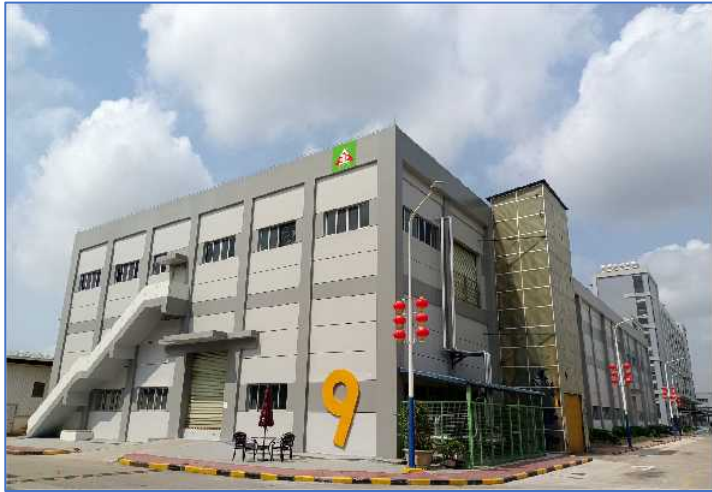
Brand new, clean and tidy factory buildings