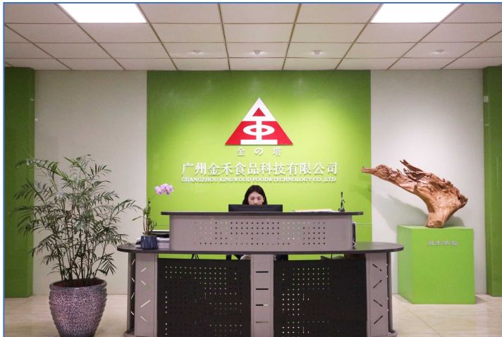
Bright and clean office environment